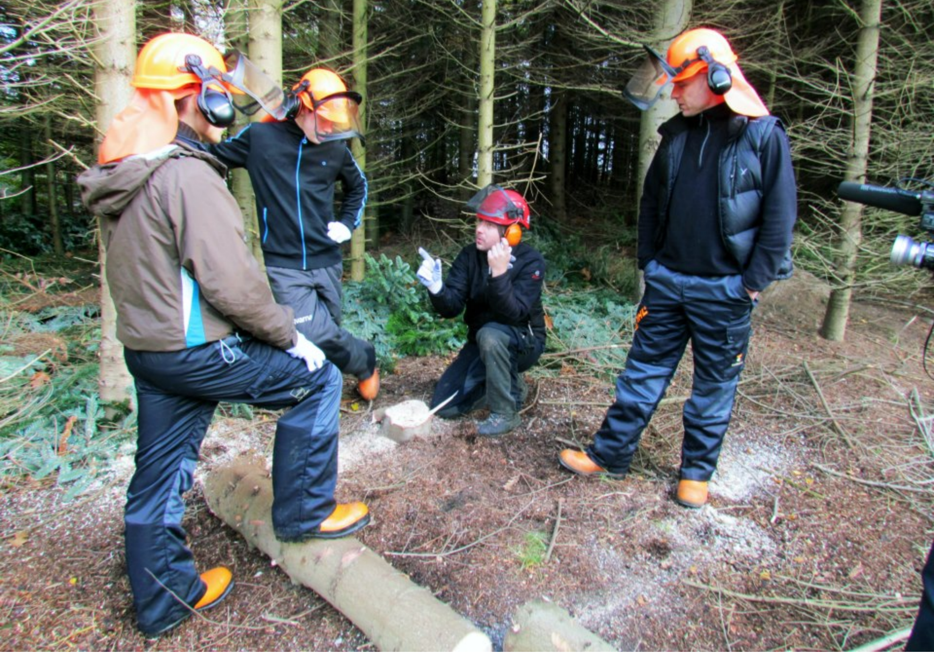
Through a process of co creation - learning new skills and creating ownership