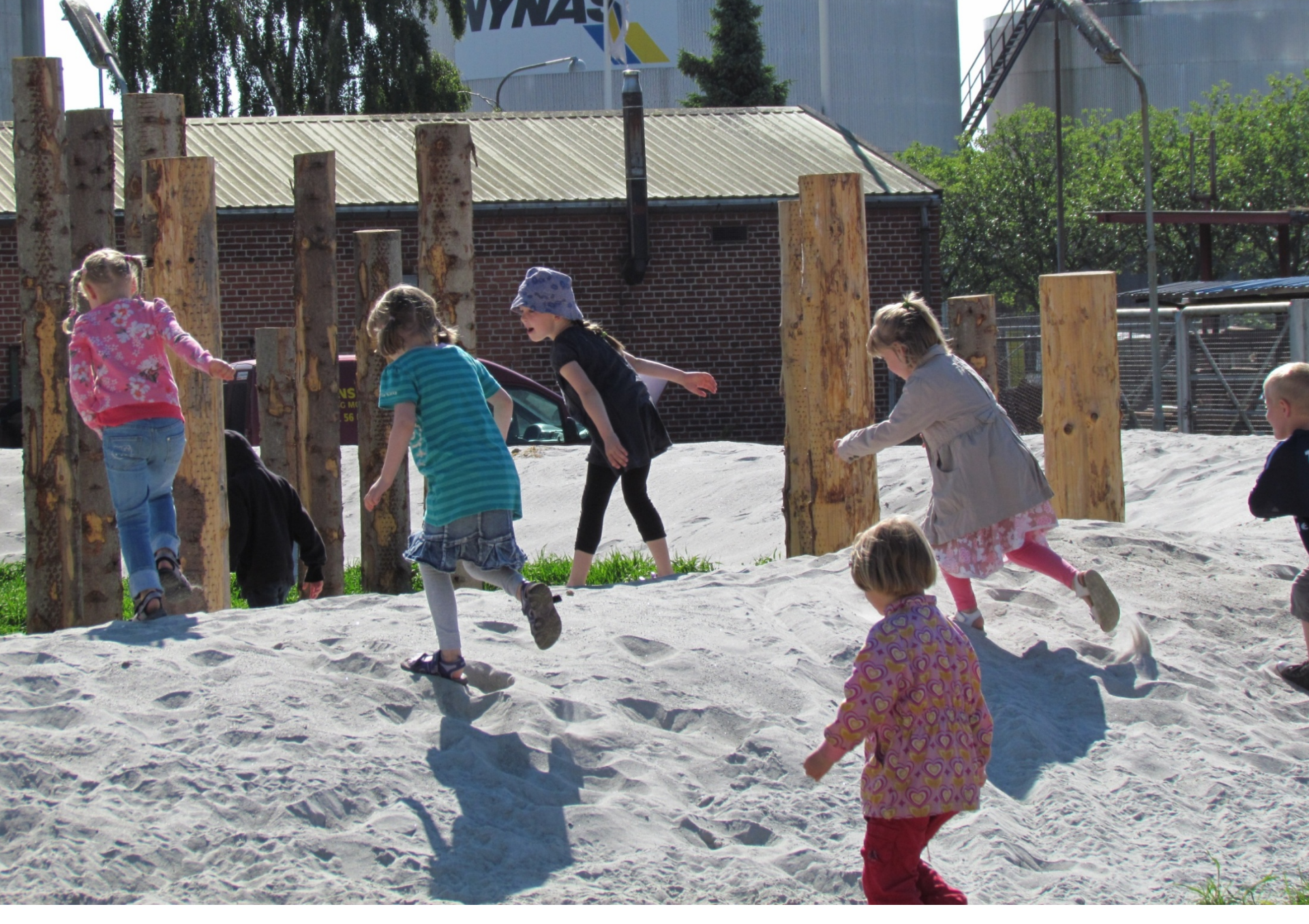
Possibility for new behaviours - reprogramming site through new experinces