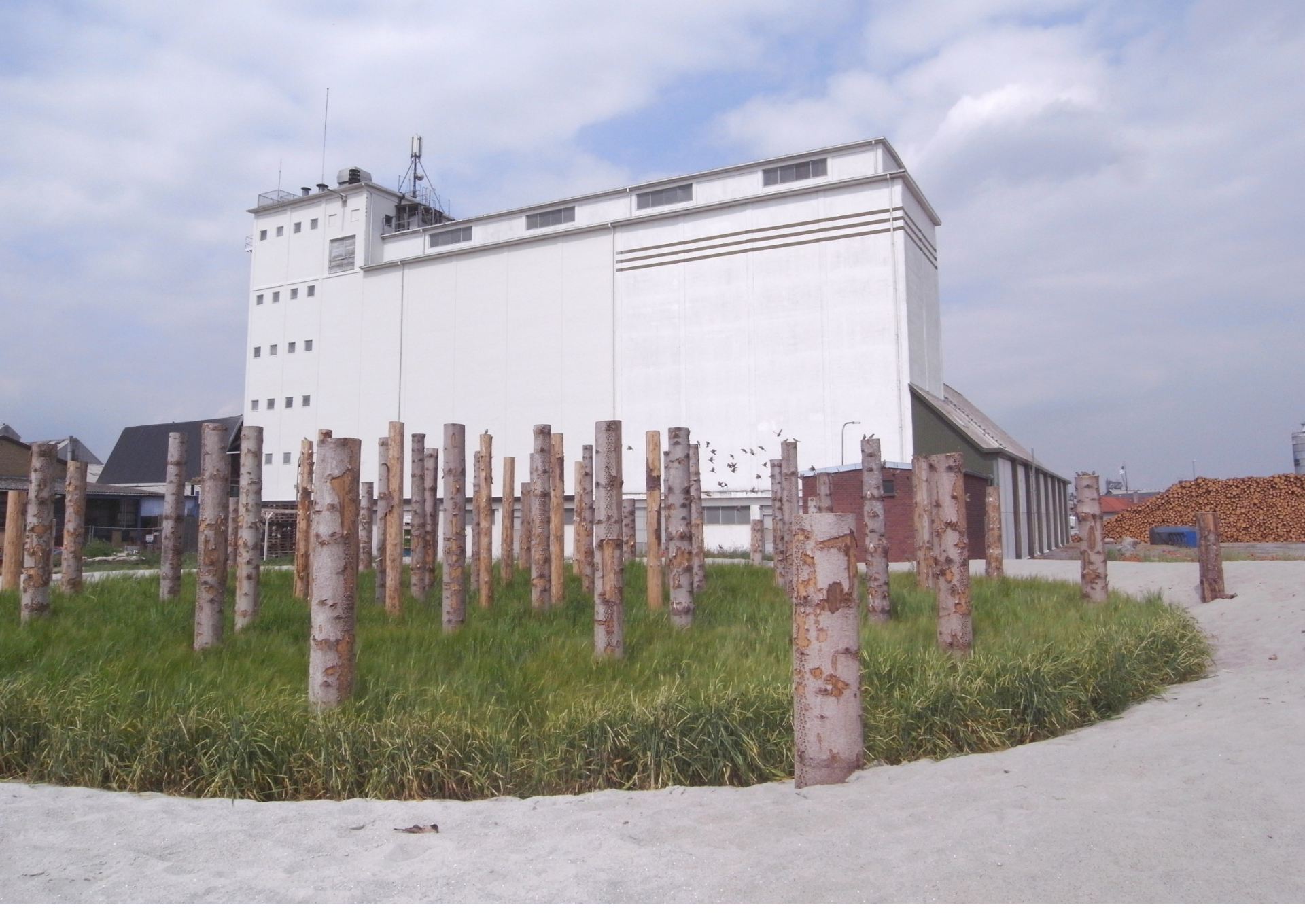
Playscape of sand and wood, Rebar (usa) created out of local materials