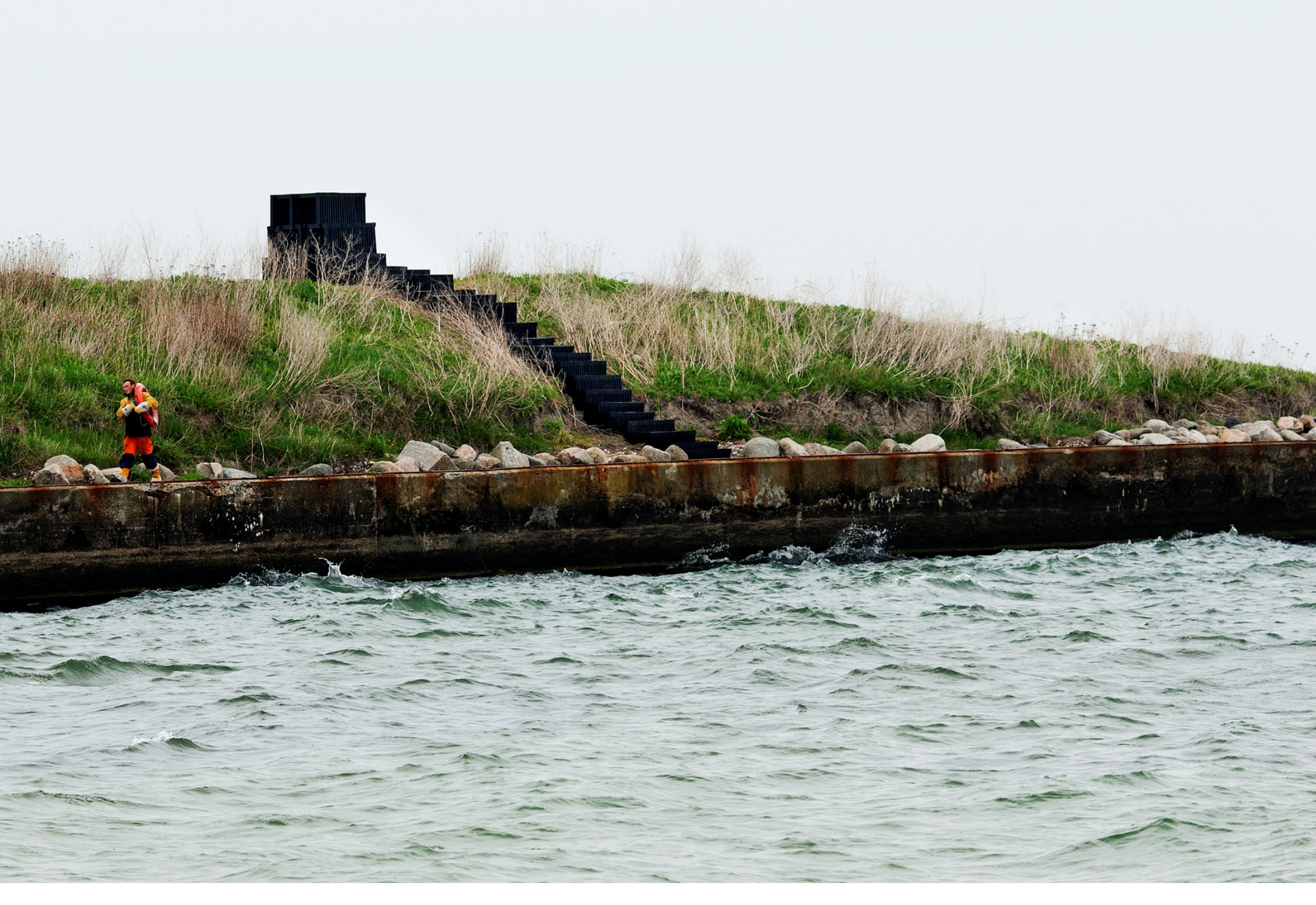
Stair draws the line of the landscape - Happyspace (SE): The snailstair