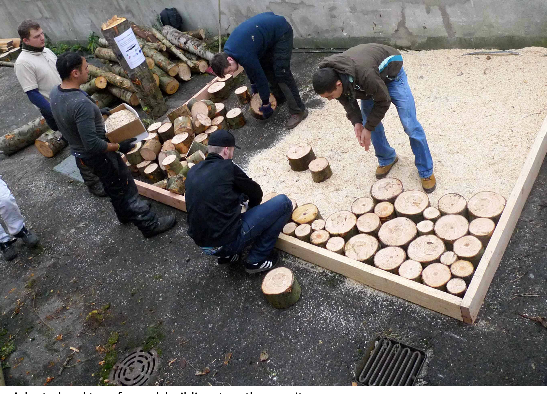
Adapted and transformed building together on site